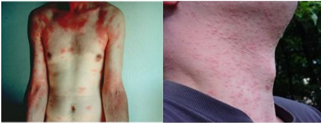
Figures 5 & 6. Gristwood & Toms images of rash symptoms on contractors exposed to OPM setae