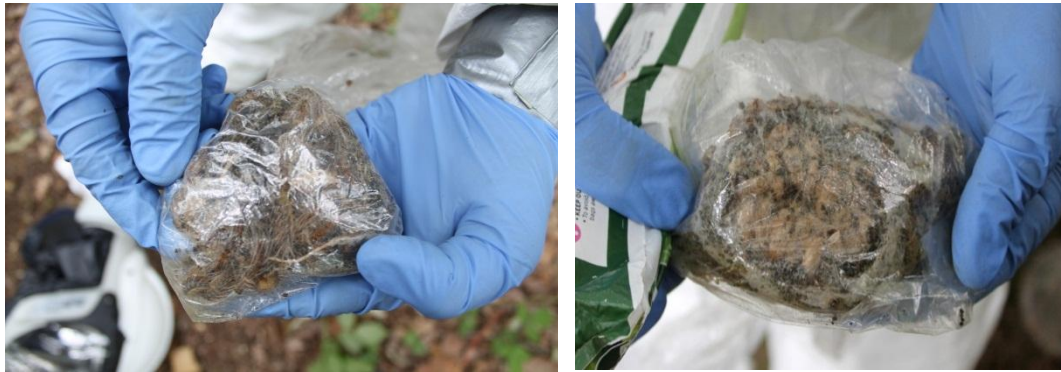
Figures 15 & 16. Author's own images of removed nests

22. The identified nests are removed and put into sealed double-skin plastic bags, which are placed into a container and then taken off-site for incineration. Figures 15 and 16 show nests containing the hairs at different stages of pupation, taken from trees no more than 50 metres apart.