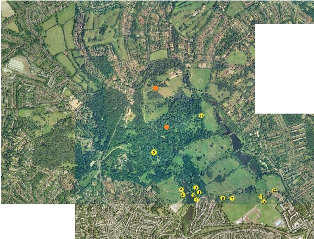
Figure 12. Map of chronological order of discovered nests on the Heath in yellow (orange marks nest located within the Kenwood Estate).

20. During this period Hampstead Heath and Queen's Park received separate Statutory Plant Health Notices to remove all nests across the sites, and to carry out spraying operations in Spring 2016.