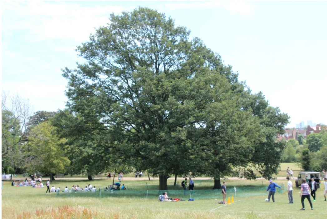
Figure 18. Trees containing nests, fenced off in an open access public area (Parliament Hill Bandstand).