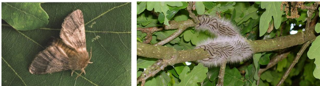
Figures 1 & 2. Forestry commission images of moth and caterpillars