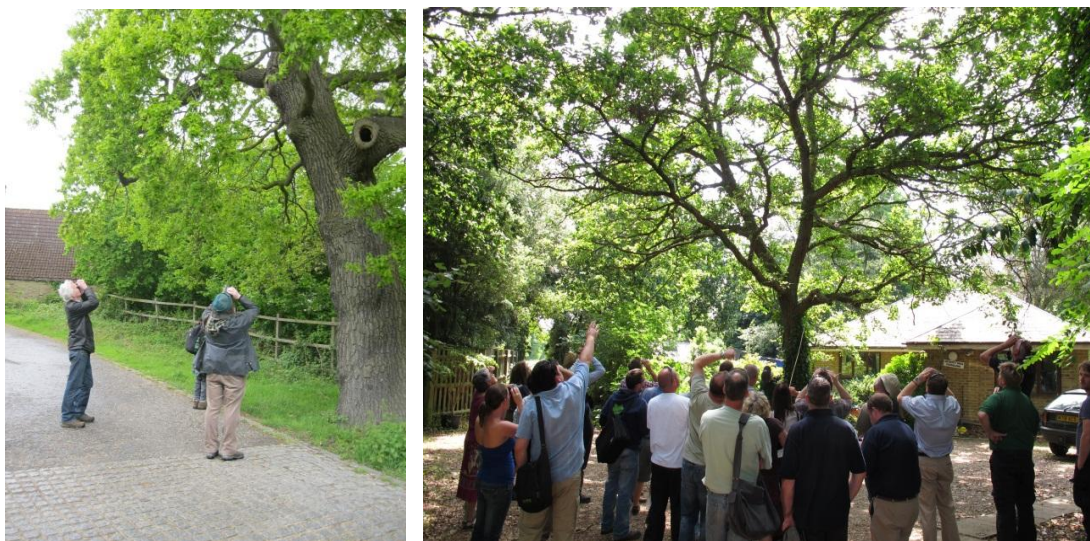
Figures 8 & 9. Author's own images of training