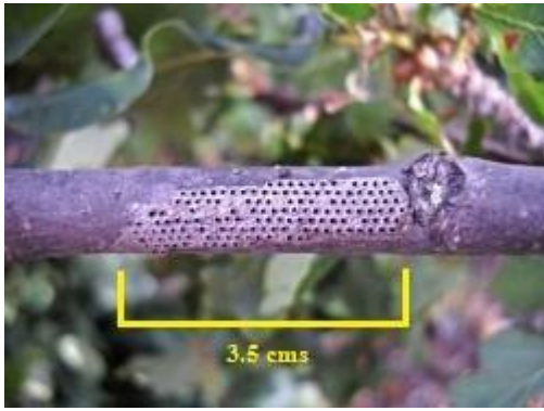
Figure 3. FC image of egg plaques