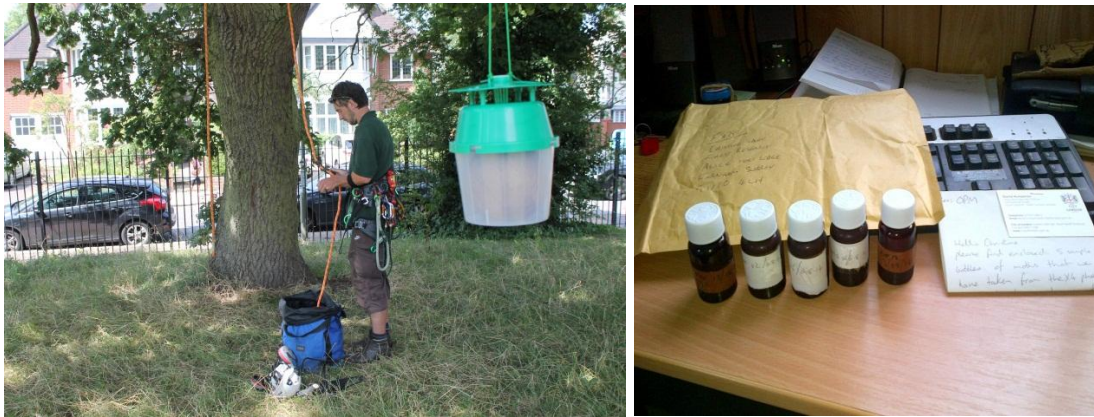
Figures 10 & 11. Author's own images of pheromone trapping