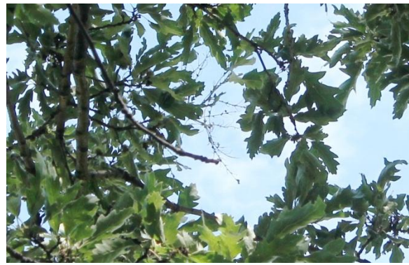
Figure 4. Author's image of browsing