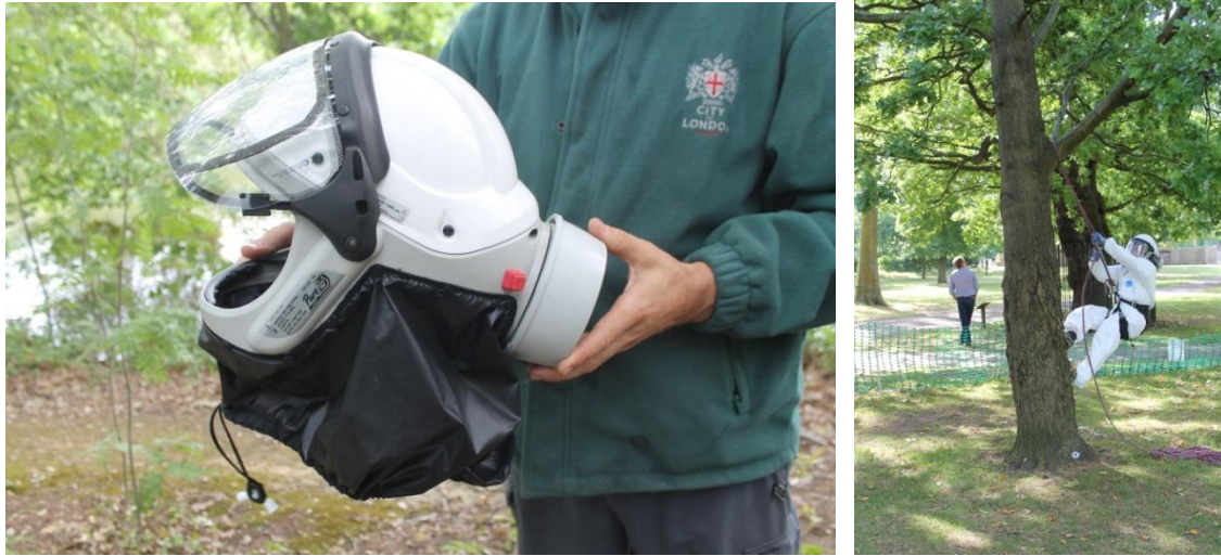
Figures 13 & 14. Images of specialist PPE

22. The identified nests are removed and put into sealed double-skin plastic bags, which are placed into a container and then taken off-site for incineration. Figures 15 and 16 show nests containing the hairs at different stages of pupation, taken from trees no more than 50 metres apart.