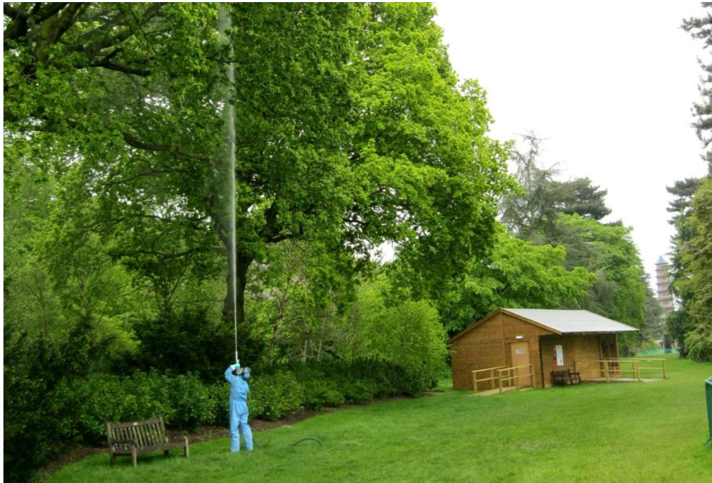
Figure 17. OPM spraying at Kew gardens

24. The Tree Team will continue inspections of areas deemed to be at risk, based on the previous year's inspection areas, the nest location map, the jogger's route map, FC inspectors' discoveries, plus public and staff reports. The Team will continue with the removal of discovered nests, and with staff presentations in the field showing nests, caterpillars and browsing.